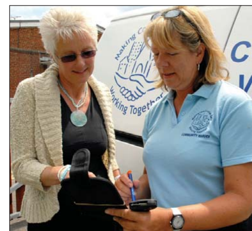
. . .with a little help from our friends.

"The Community Wardens have been able to win the trust and confidence of residents, through working in specific neighbourhoods. Members of the public feel more comfortable speaking to a warden about incidents of anti-social behaviour or other nuisance issues rather than the police or any other agency."