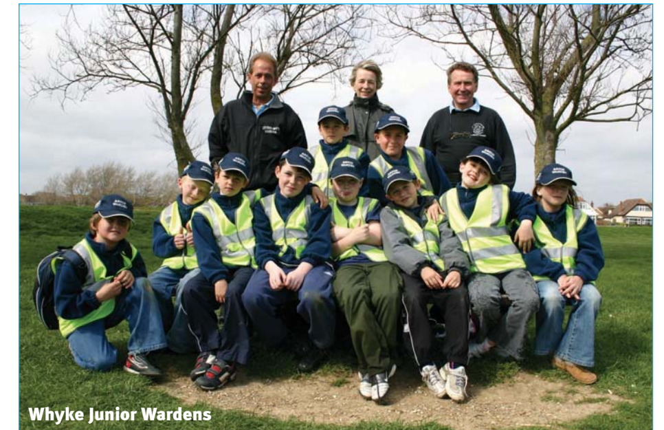
Whyke Junior Wardens