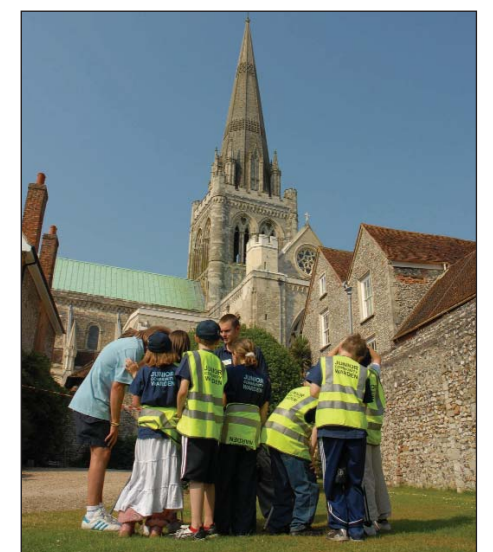
Visiting the peregrine falcons at Chichester Cathedral.